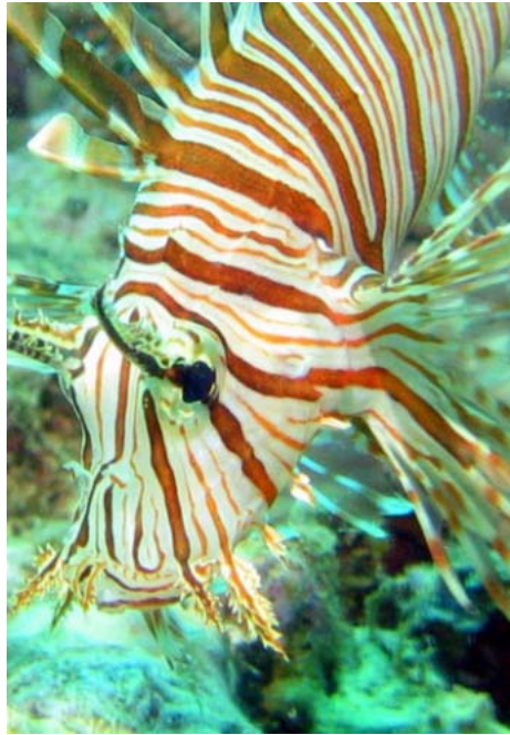
Details on pg. 2