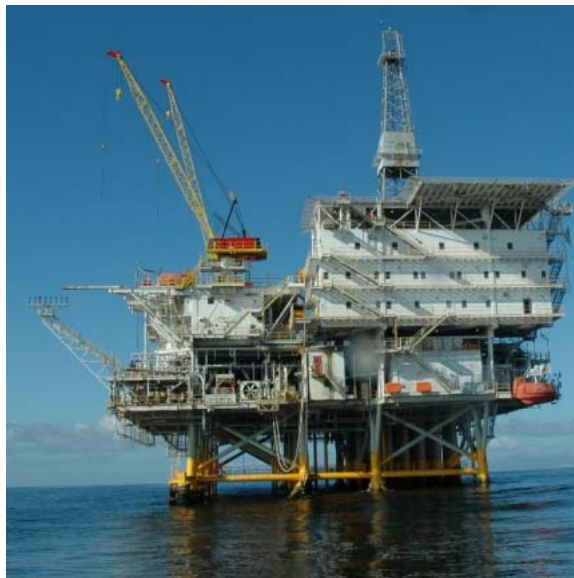
File Photo of Eureka

as they could find no apparent reason for his distress at this time. He was released from the hospital on Monday at 2pm! A potentially very serious dive emergency medical problem thankfully averted!